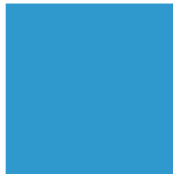
Secondary Starlight Blue